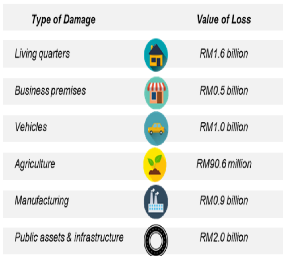
Exhibit 1: Value of Flood Losses by Type of Damage

Overall losses due to the floods recorded RM6.1 billion which equivalent 0.40 per cent as against nominal Gross Domestic Product. Living quarters losses were RM1.6 billion, business premises RM0.5 billion, vehicles RM1.0 billion, agriculture RM90.6 million, manufacturing RM0.9 billion and public assets & infrastructure RM2.0 billion as shown in Exhibit 1.