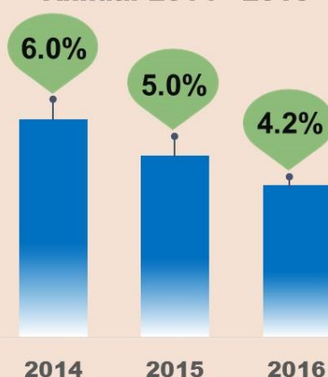
Annual 2014 - 2016