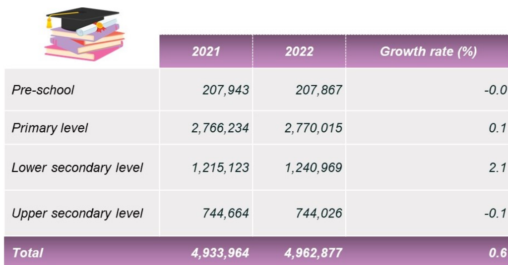
Table 3: Number of pupils in government and government-aided schools by level of education, Malaysia, 2021 and 2022

The number of pupils in government and government-aided schools in 2022 were 4,962.9 thousand, increased by 0.6 per cent from 4,934.0 thousand in 2021. This increase is mainly due to an increase of 25.8 thousand pupils (2.1%) at the lower secondary level as compared to the previous year. At the same time, primary level enrolment increased by 3.8 thousand to 2,770.0 thousand as compared to 2,766.2 thousand in 2021.